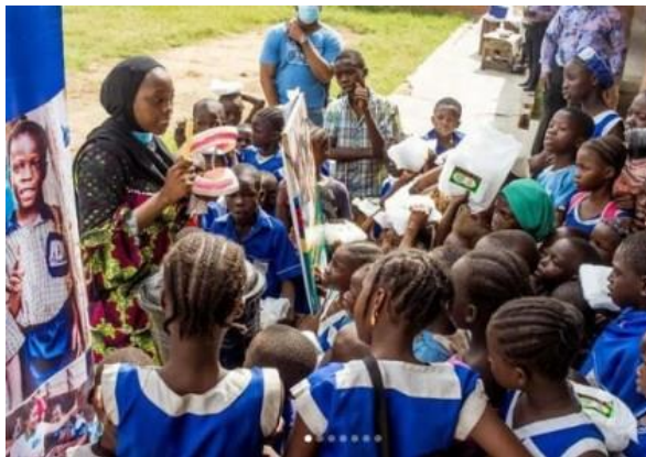
A volunteer educating children on oral hygiene