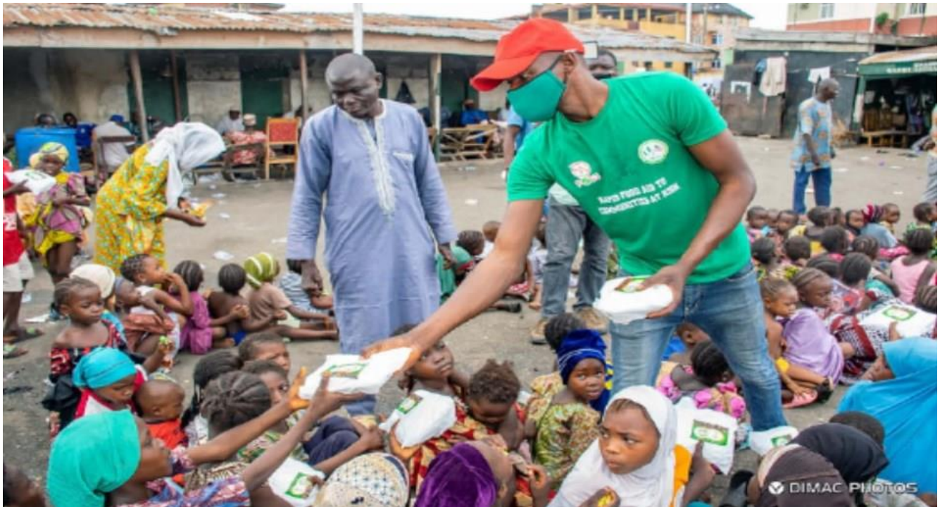
Food distribution to children at Okobaba, Lagos Nigeria