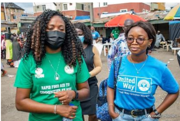
Sweet Sensation and United Way volunteers at the event